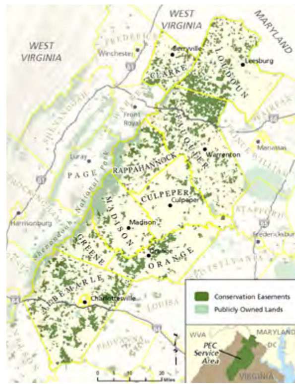
The Piedmont Environmental Council's nine-county region. See full-size map on page seven.