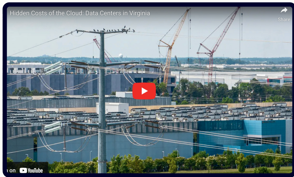
“Hidden Costs of the Cloud: Data Centers in Virginia” video

involve your friends, family, neighbors, etc. involved by sharing resources at pecva.org/datacenters